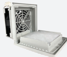
3. Insert Filter