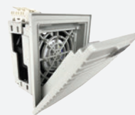
1. Open Grille