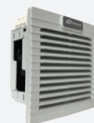
4. Close Grille