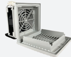
2. Remove Filter